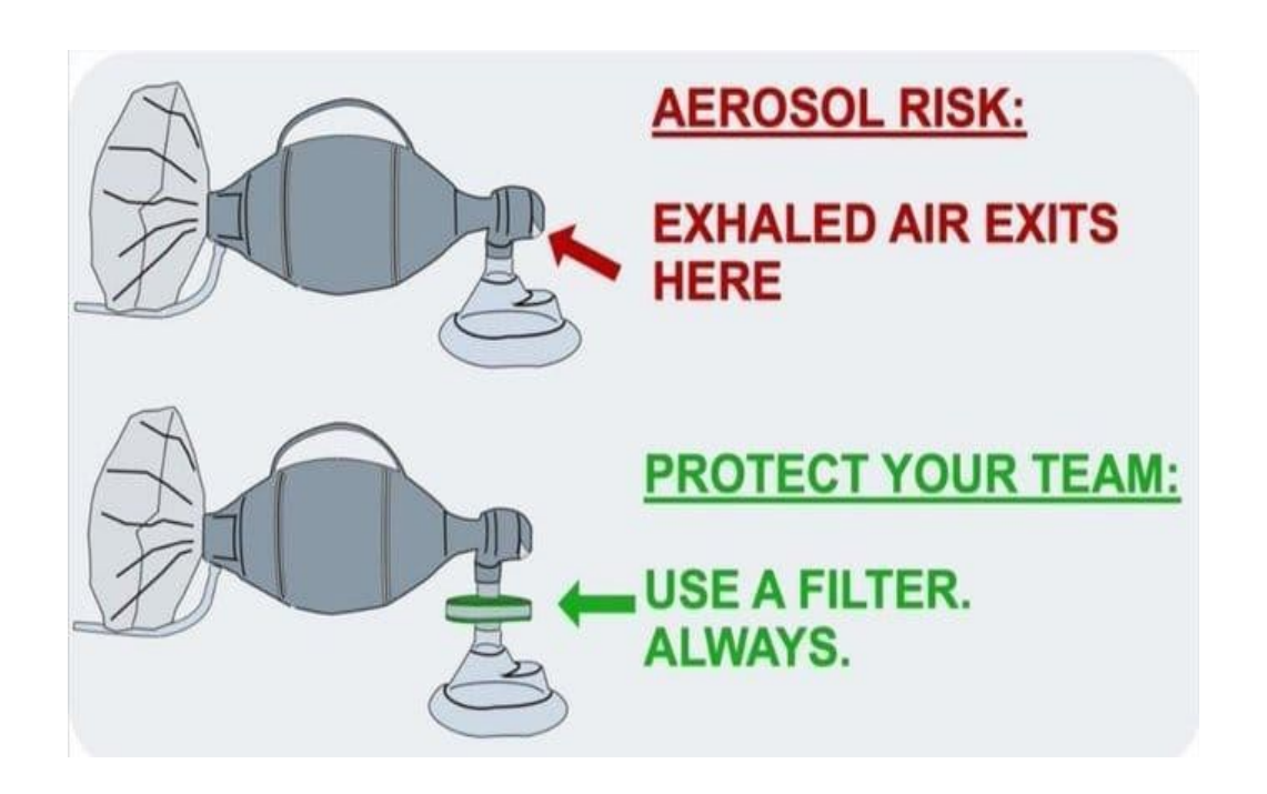
Bag mask with an attached HEPA