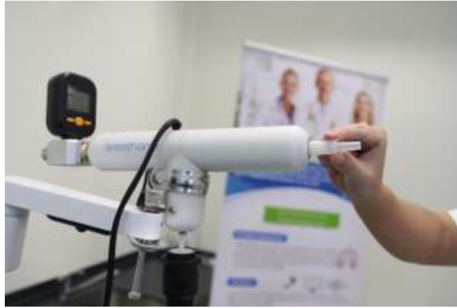
Figure 1: Breathonix breathalyser

On the other hand, India and Israel are jointly developing 30-second COVID-19 breathalyser test based on terahertz waves. The team of researchers are currently conducting trials using a large number of samples. The test is expected to be less costly and will be able to deliver results on-site which eliminate logistics as well as the cost involved for sending samples to the laboratory. 9