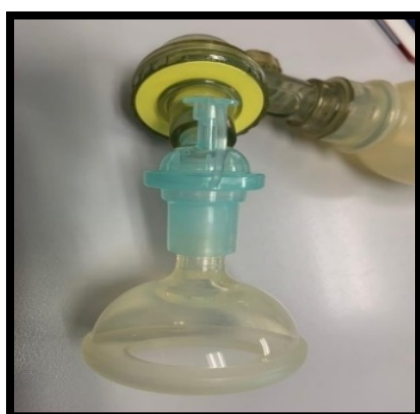
Figure 1: Self-inflating bag with bacterial / viral filter attached