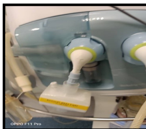
Figure 2: HEPA filter at expiratory limb of ventilator circuit