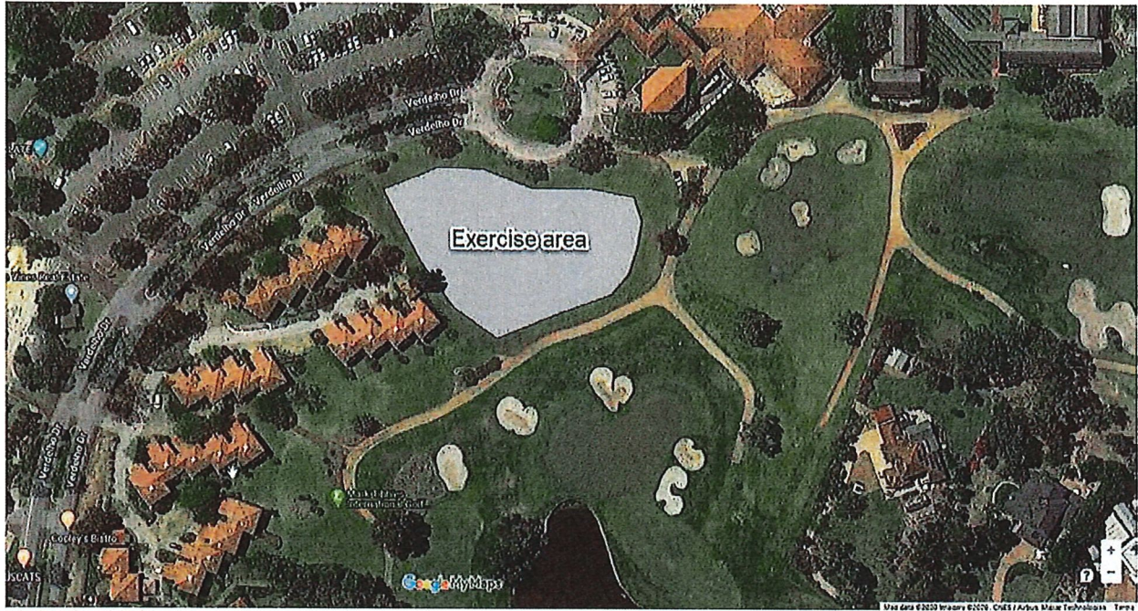
Map of exercise area