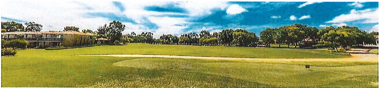
Photograph of exercise area