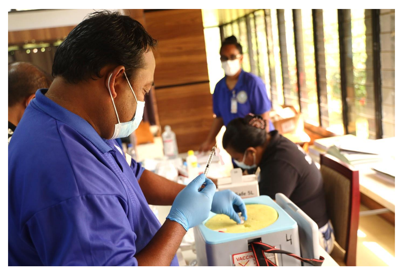
Pictured Above: A first responder prepares the COVID-19 vaccine