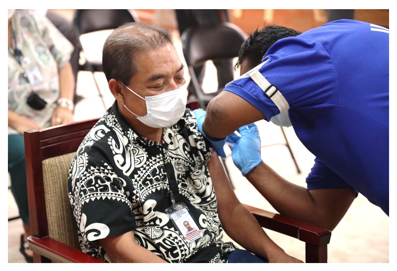
Pictured Above: Pohnpei State's Immunization Program Manager receives the COVID-19 vaccine