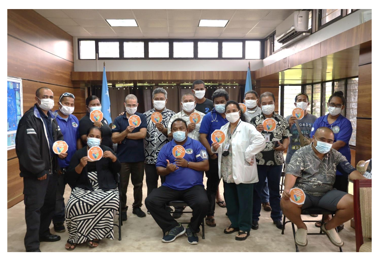
Pictured Above: FSM National & Pohnpei State first responders pose at the conclusion of the COVID-19 vaccination launch event