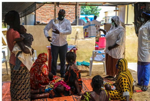
Information sessions to inform mothers about nutritional care during COVID-19 at Toukra Health Centre.

UNICEF has continued to work closely with provincial health delegates to ensure treatment of children suffering from severe acute malnutrition (SAM), while minimizing the risk of transmission of COVID-19 by reducing overcrowding through ensuring more frequent provision of services as well as hand-washing and physical distancing at nutrition units. As of December 2020, UNICEF has provided supplies (192,405 RUTF boxes as well as folic acid, F-75 and F-100 therapeutic milk) and technical assistance for the treatment of 308,070 children suffering from SAM within the targeted health centres. This represents 74.4% of the expected SAM cases, and a 92% cured rate.