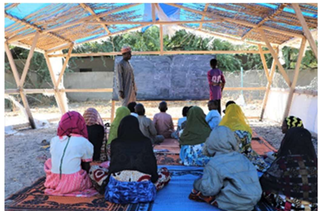
Pupils and teacher in a classroom at the Koranic school of Bol

During the reporting period, UNICEF and partners provided 5,186 people in 2 provinces (Borkou and Salamat) with key messages on COVID-19 prevention measures and child protection, reaching a total of 87,609 beneficiaries to date as part of the prevention and response to the COVID-19 pandemic.