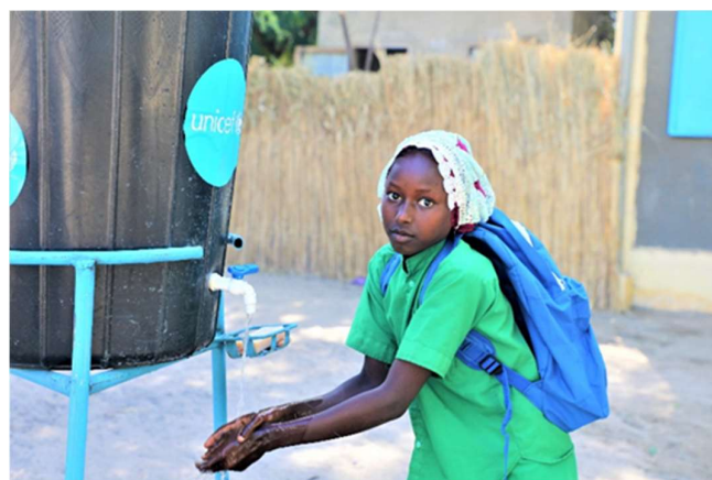
Distribution of school kits provided as part of Education Cannot Wait's support. Each school has been provided with hand washing kits for COVID-19 prevention.