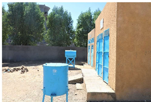
New toilets and hand washing facilities at the Boutalbagara school in N'Djaména, as part of compliance with COVID-19 prevention measures

UNICEF also continued to support the prevention and treatment of children suffering from severe acute malnutrition, through the implementation of WASH in Nut activities coupled with the fight against COVID-19. During the month of December 2020, UNICEF through partner ALIMA provided WASH in Nut kits to 5,814 malnourished children in N'Djaména. A total of 62,411 malnourished children were assisted in 2020 in the province of N'Djaména.