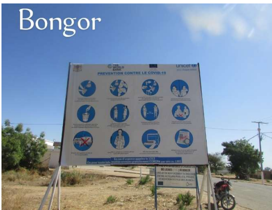
A 12 square metre poster on how to protect oneself against COVID-19, in the city of Bongor.